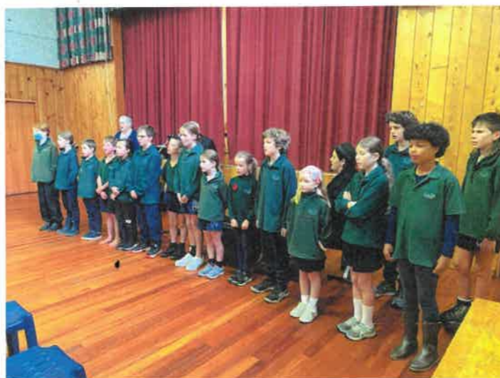
Students lead the National Anthem at ANZAC