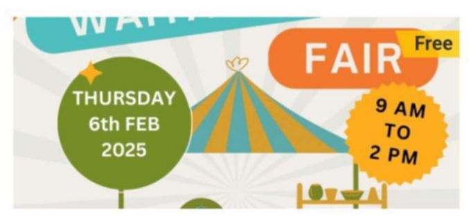
No Eftpos so be sure to bring cash!