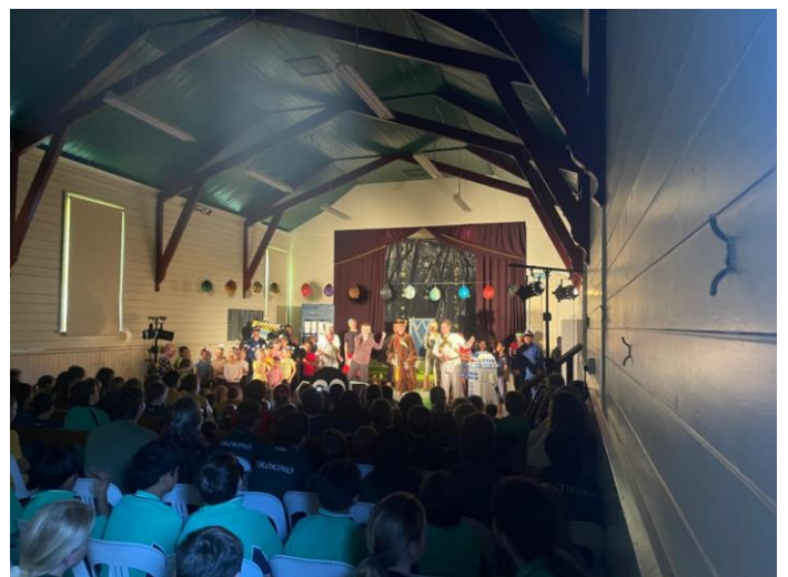
Thank you to Ongaonga School for hosting us at their production Star Warts, The Umpre Strikes Back!