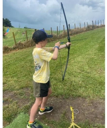
Our Year 3-5 students had a blast at Ranui Camp.