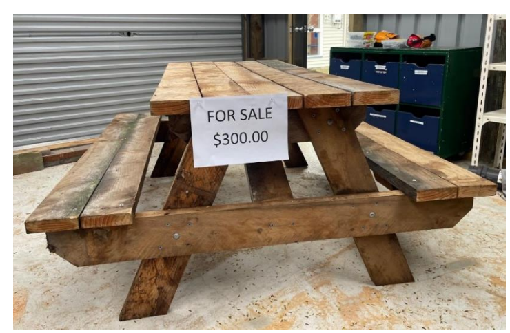
Please contact the school if you would like to purchase one of the students picnic benches. These were made by our Year 7&8 students during their Technology lessons last term. The money will go towards School Camps.